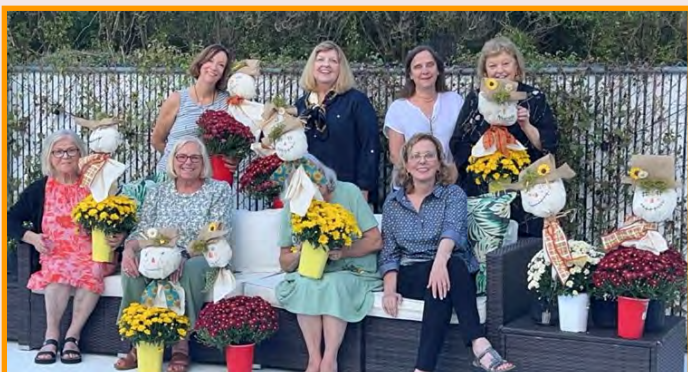
Members show off their creations.