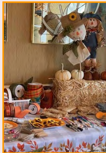
The well-stocked craft table