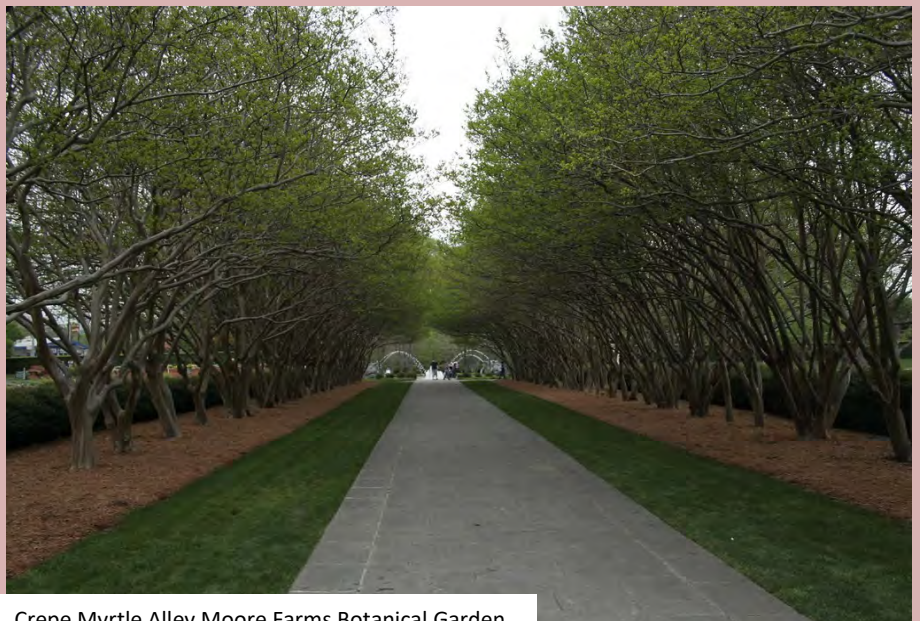
Crepe Myrtle Alley Moore Farms Botanical Garden